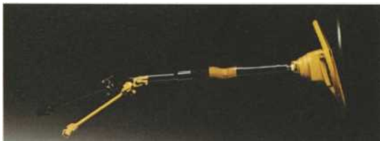
The steering mechanism: many ingenious safety features.

The Volvo bodies, for instance, are very strong and torsionally stiff. The passenger compartments are designed as a safety cage and the front and rear ends are energy-absorbing.