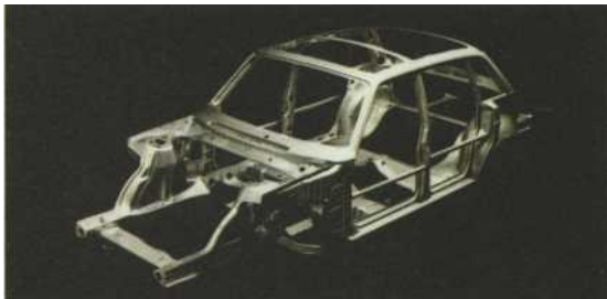
closed section profiles form a reliable safety cage.

Over the years, Volvo has shown a deep interest in different aspects of car safety. As a result, many of the safety features introduced by Volvo, have been clearly ahead of legislation. All the Volvo car series are designed to give a high degree of safety and to avoid injuries to a great extent in case of an accident.