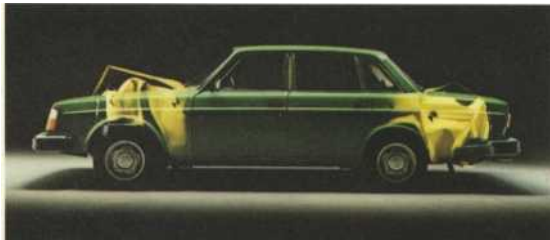
Front and rear ends have energy-absorbing crumple zones.

The Volvo bodies, for instance, are very strong and torsionally stiff. The passenger compartments are designed as a safety cage and the front and rear ends are energy-absorbing.