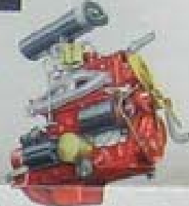
Volvo 600 cc Diesel Engine

600 cc DIESEL The Volvo Amazon is a good car. It is a beautiful car. Many people will want to buy it for its pleasure value — and they will never regret it. The perfect styling reflects the fastidious attention to detail which has been the guiding principle for the men responsible for the Amazon — for the designers as well as for the mechanics in the assembly line. The Volvo Amazon belongs to the class of products which has given the words "Stake in Sweden" such fame all over the world. The Volvo Amazon is a good car. Strength, simplicity, comfort, economy and all-round safety are a few of its foremost attributes.