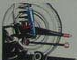
New rear wheel suspension

The Volvo Amazon has an extra roof and body. The extra roof and body are designed to absorb the impact of a collision.