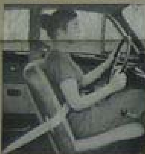
More Volvo initiative for your safety.