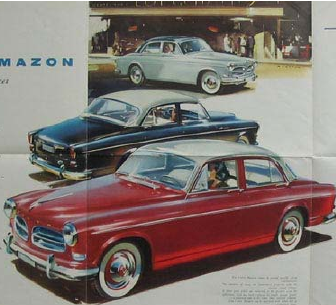
The Volvo Amazon is a good car. It is a beautiful car. Many people will want to buy it for its pleasure value — and they will never regret it. The perfect styling reflects the fastidious attention to detail which has been the guiding principle for the men responsible for the Amazon — for the designers as well as for the mechanics in the assembly line. The Volvo Amazon belongs to the class of products which has given the words "Stake in Sweden" such fame all over the world. The Volvo Amazon is a good car. Strength, simplicity, comfort, economy and all-round safety are a few of its foremost attributes.

There is no doubt about it — the Volvo Amazon is a beautiful car. Many people will want to buy it for its pleasure value — and they will never regret it. The perfect styling reflects the fastidious attention to detail which has been the guiding principle for the men responsible for the Amazon — for the designers as well as for the mechanics in the assembly line. The Volvo Amazon belongs to the class of products which has given the words "Stake in Sweden" such fame all over the world. The Volvo Amazon is a good car. Strength, simplicity, comfort, economy and all-round safety are a few of its foremost attributes.