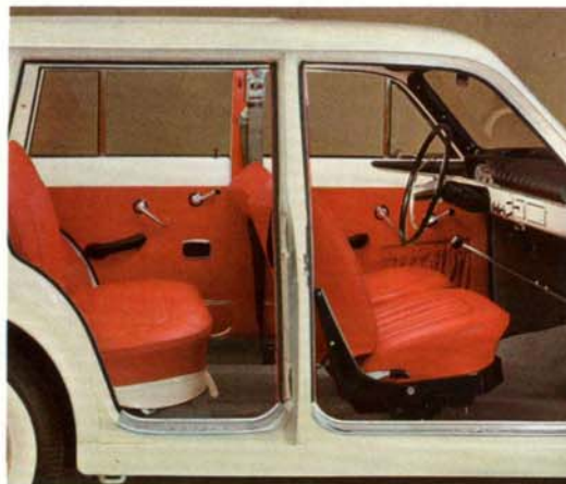
Wide doors give easy access to the elegant interior.

This Station Wagon is spacious and versatile. Its roomy interior combines passenger car comfort with the load carrying capacity of a small truck. It is economical and hard wearing in both functions. As a passenger car, it seats five adults comfortably, luggage space is generous. A few simple adjustments convert it into a two seater with a load 72" deep, 34" high, 50" wide. The rear opening divides horizontally; the upper half may be opened from the inside. The rear compartment floor is low for ease of loading and unloading. Fragile or light packages are protected by a durable, attractive textile floor mat. The interior is completely lined with practical and smart leatherette.