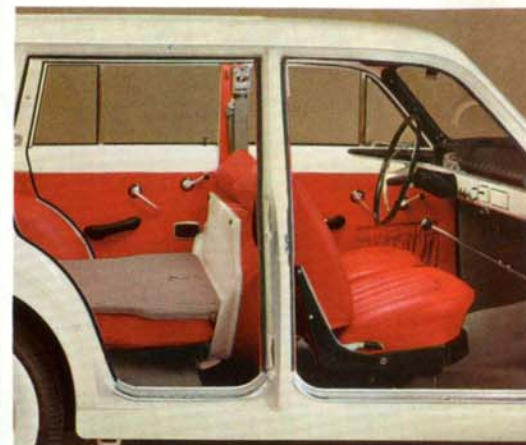
Luggage space is easily accessible through rear side doors.